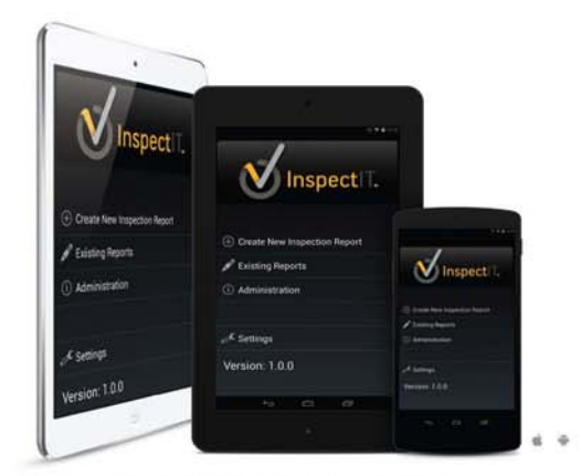
Available For iPad® • Android™

The InspectIT Home Inspection Software is the easiest reporting application on the market today, with a user-interface that is simple to use. InspectIT was designed by industry professionals that understand how this tool will help make your job easier and your business more successful.